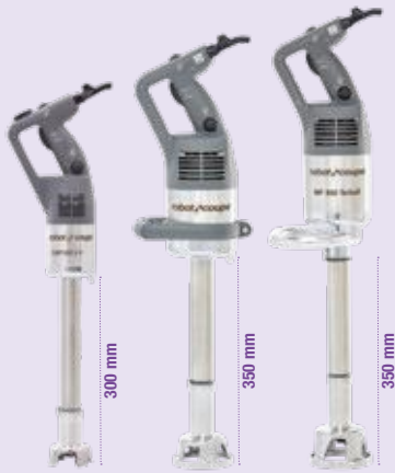
350 W CMP 300 V.V. 30 litres 500 W MP 350 Ultra TP 50 litres 1000 W MP 800 Turbo TP 100 litres