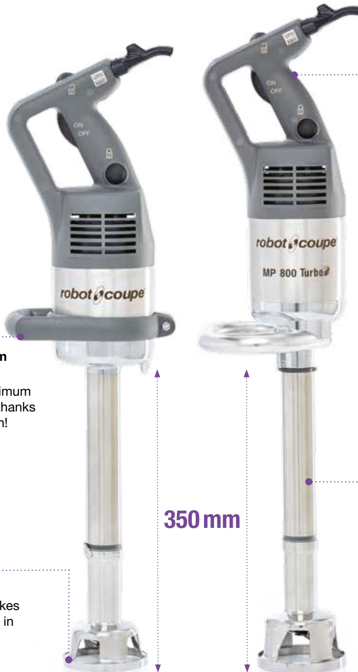
MP 350 Ultra TP

Reinforced bell with a stainless steel ring that makes the appliance easy to glide in a tilting pan, with excellent manoeuvrability.