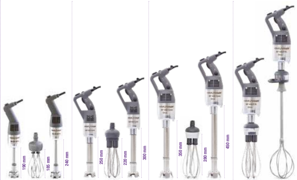
270 W Mini MP 190 Combi 190 mm 290 W Mini MP 240 Combi 185 mm 310 W CMP 250 Combi 240 mm 350 W CMP 300 Combi 250 mm 440 W MP 350 Combi Ultra 220 mm 500 W MP 450 Combi Ultra 300 mm 500 W MP 450 FW Ultra 350 mm 500 W MP 450 XL FW Ultra 280 mm 500 W MP 450 XL FW Ultra 450 mm