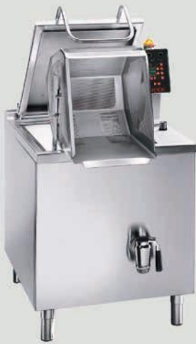
○ CPM 1-12