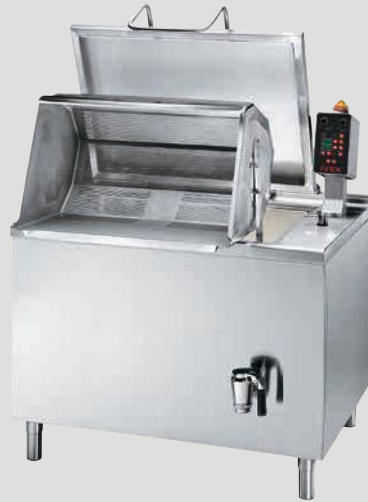
○ CPM 1-24