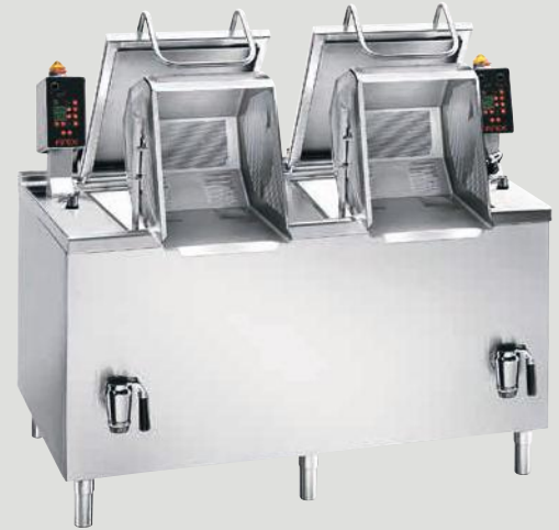
○ CPM 2-12