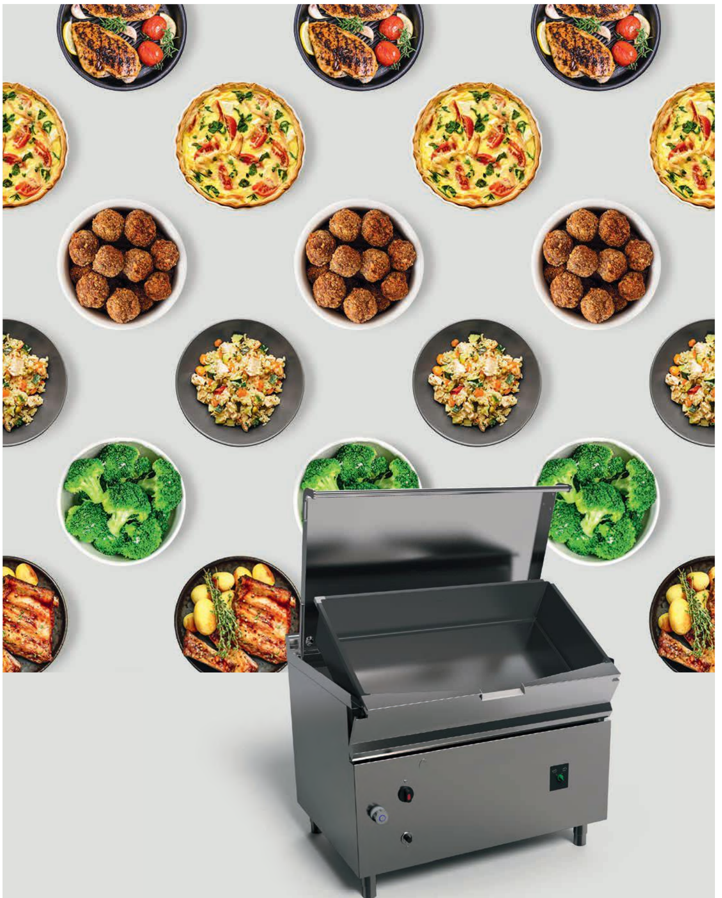
Easybratt Tilting bratt pan