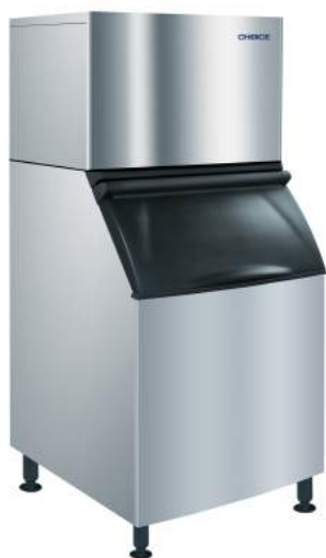
H1000 Ice Machine on H530 Bin